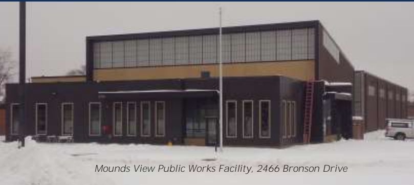
Mounds View Public Works Facility, 2466 Bronson Drive