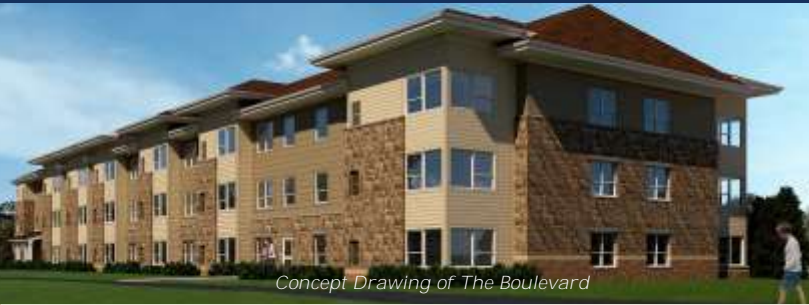
Concept Drawing of The Boulevard