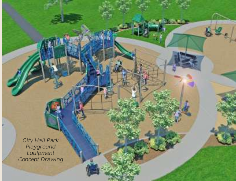
City Hall Park Playground Equipment Concept Drawing

The City Council, along with staff and the Parks and Recreation and Forestry Commission, evaluated and obtained bids to replace the existing 20+ year old playground equipment at City Hall Park. On October 9, 2017, City Council approved the purchase and the overall concept and layout for the playground equipment and the continuation with a design and cost proposal for a splash pad feature. Construction is scheduled to start in the spring and should be completed by late summer!