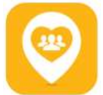
PulsePoint AED Available for iOS & Android

The City of Mounds View has met the application requirements for a Heart Safe Community by conducting 14 training events held with the Adult Education Center, Mounds View Lions, New Brighton/Mounds View Rotary, Medtronic-Mounds View Campus, public classes, and a booth at public events. The City of Mounds View has a map of AEDs posted on the city website and on the free smartphone app PulsePoint AED. Look for the Heart Safe booth at future public events including Festival in the Park and the National Night Out Pre-Party.