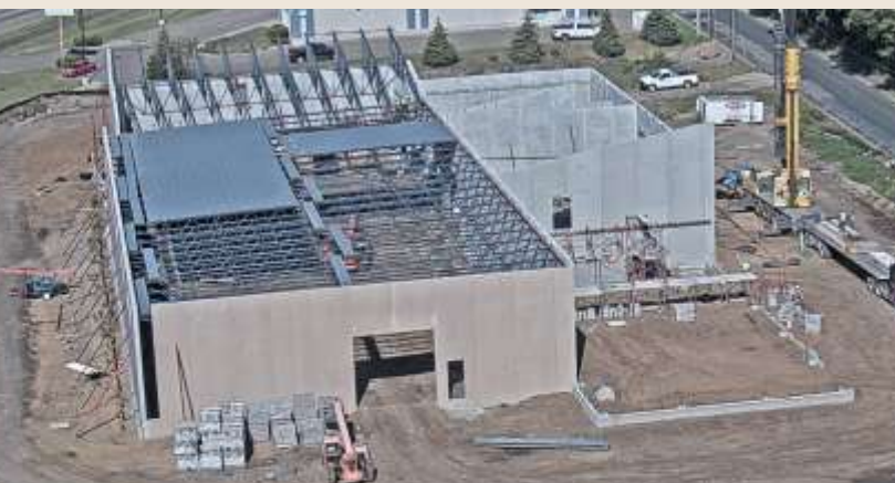
New Mounds View Public Works Facility Under Construction

The Mounds View Public Works Department suggests that any resident experiencing a sewer backup call the Public Works Department immediately so that the sewer main can be checked for blockages. Public Works can be reached at 763-717-4050, Monday through Friday, from 7:00 a.m.-3:30 p.m. After hours assistance can be obtained by calling Ramsey County Dispatch at 651-484-9155.