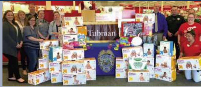
Mounds View Police Department supporting the Tubman "April Showers" Diaper Drive