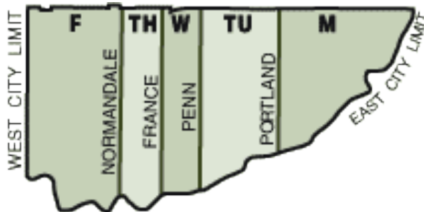
Figure 2-1 Residential Solid Waste Hauling Districts in Bloomington

In 1995 the Council considered further improvements, to more fully organize trash and recycling collection. There were several contentious public hearings, and the Council decided not to pursue the matter at that time. Individual neighborhoods and homeowner organizations, however, pursued limited organization of trash collection services on their own, believing they had the support of the City.