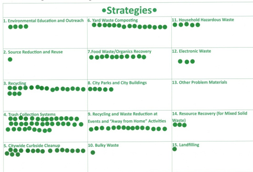
Figure 7-2 Draft Outline of Strategies: Example Large Sheet of Open House Results (First of two large sheets of green dot labels on the draft outline of Strategies)

Figure 7-2 shows one example of the two large sheets displaying the results of Open House participants' dot label rankings on the draft Goals.