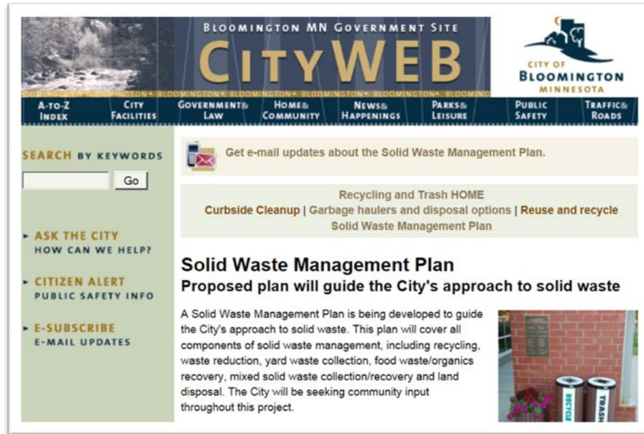
Figure 5-1 Bloomington Web Page Dedicated Updates About to the Solid Waste Management Plan